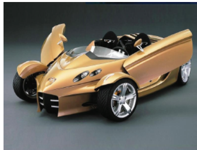
2009 Hyundai Cameron Concept

The team at Acme Cars want to make this a fun and enjoyable opportunity for you. In fact many of our customers drive in with their old car and out with their new - the same day!