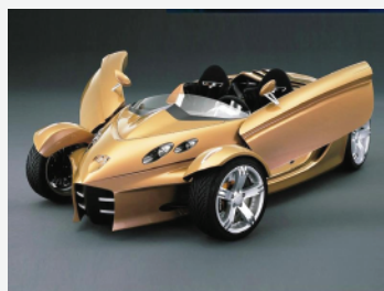
2009 Hyundai Cameron Concept

Had a change in circumstance or lifestyle and looking to upgrade to something else? Let us know. Our large selection covers most customer requests, but we'd be more than happy to source you something outside of our stock, if we don't quite have what you're after.