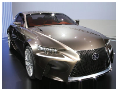
2012 Lexus LF Concept

I've listed a couple below. Please just click on each to get more info from our website, or if you prefer we'd be happy to talk you through the features of each in person.