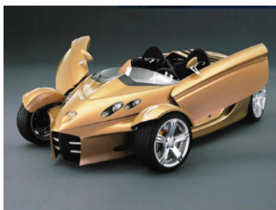
2009 Hyundai Cameron Concept

The team at Acme Cars want to make this a fun and enjoyable opportunity for you. In fact many of our customers drive in with their old car and out with their new - the same day!